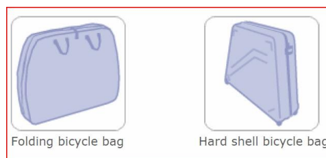
Folding bicycle bag