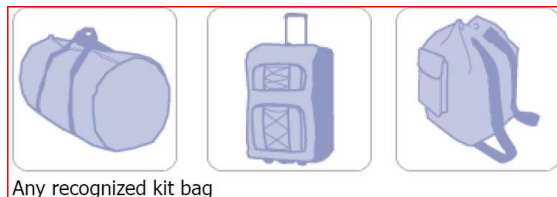
Any recognized kit bag