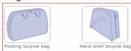
Folding bicycle bag

Description: Single seat bicycle; touring or racing, without engine. NOT ALLOWED as free check-in baggage. Approval in advance: Required upon reservation. Packaging: Handlebars must be turned so that they are parallel with the frame, pedals must be removed, tires must be flat and the bicycle must be packed in a bag or a cardboard box. Weight: 20 kg