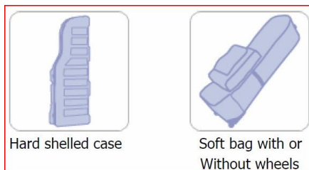
Hard shelled case

Description: 1 golf bag with 14 clubs, 12 golf balls and 1 pair of golf shoes. NOT ALLOWED as free check-in baggage. Approval in advance: Required upon reservation. Packaging: Must be packed in a golf bag. Weight: 20 kg