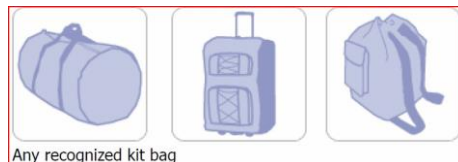
Any recognized kit bag

Description: 1 scuba tank (empty, switched off, energy source separately packed, removed battery protected against short-circuit), 1 pressure relief valve, 1 regulator, 1 BCD-jacket, 2 fins, 1 mask, 1 knife, 1 harpoon, 1 life-saving jacket. NOT ALLOWED as free check-in baggage. Approval in advance: Required upon reservation. Packaging: Must be packed appropriately. Tank must be empty. Weight: 32 kg